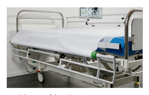
(Out of bed position)